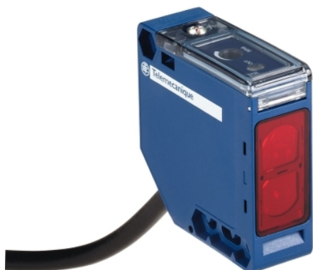
photo-electric sensor - XUK - polarised - Sn 5m - 12..24VDC - cable 10m