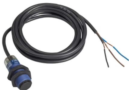
photo-electric sensor - XUB - receiver - Sn 15m - 12..24VDC - cable 5m