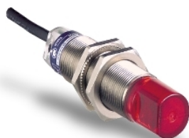
photo-electric sensor - XUB - emitter - 90° - 12..24VDC - cable 5m