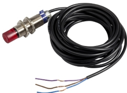
photo-electric sensor - XUB - emitter - 90° - 12..24VDC - cable 2m